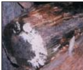
Mold growing outdoors on firewood. Molds come in many colors; both white and black molds are shown here.

W hy is mold growing in my home? Molds are part of the natural environment. Outdoors, molds play a part in nature by breaking down dead organic matter such as fallen leaves and dead trees, but indoors, mold growth should be avoided. Molds reproduce by means of tiny spores; the spores are invisible to the naked eye and float through outdoor and indoor air. Mold may begin growing indoors when mold spores land on surfaces that are wet. There are many types of mold, and none of them will grow without water or moisture.