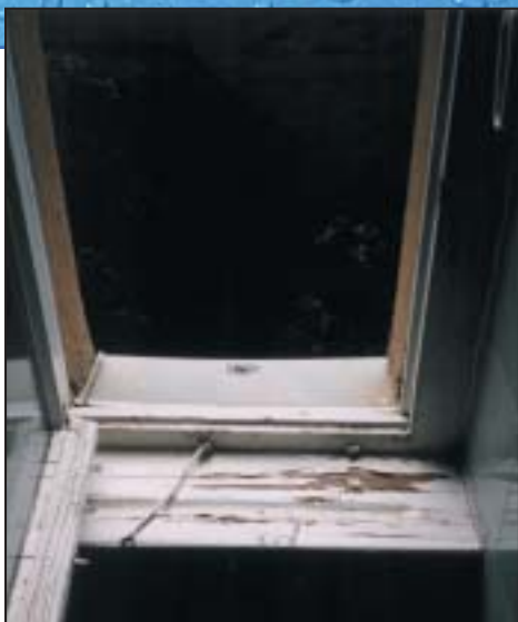
Leaky window – mold is beginning to rot the wooden frame and windowsill.

If you already have a mold problem – ACT QUICKLY. Mold damages what it grows on. The longer it grows, the more damage it can cause.