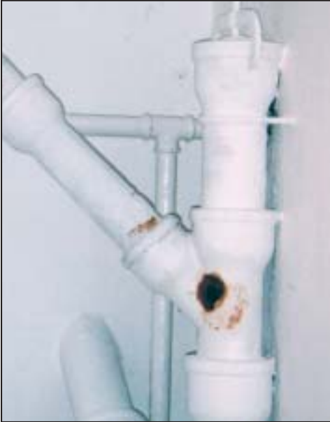
Rust is an indicator that condensation occurs on this drainpipe. The pipe should be insulated to prevent condensation.

Renters: Report all plumbing leaks and moisture problems immediately to your building owner, manager, or superintendent. In cases where persistent water problems are not addressed, you may want to contact local, state, or federal health or housing authorities.